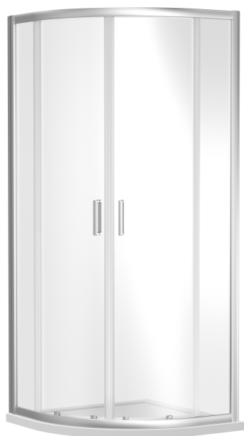
SQ Quadrant Enclosure

Description: 900X900x1850mm Quadrant Enclosure