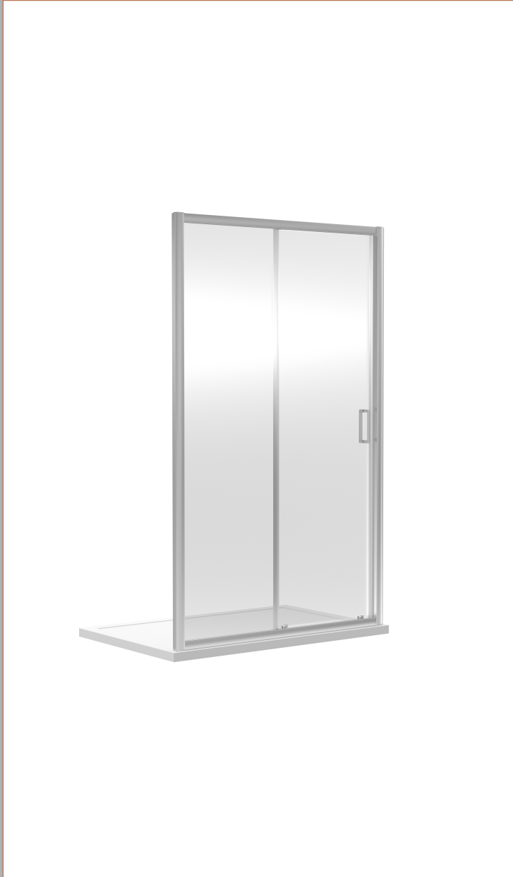
SQ Slider Enclosure

Description: 1200X1850mm Sliding Shower Door