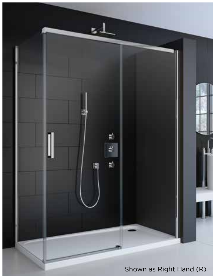
Shown as Right Hand (R)