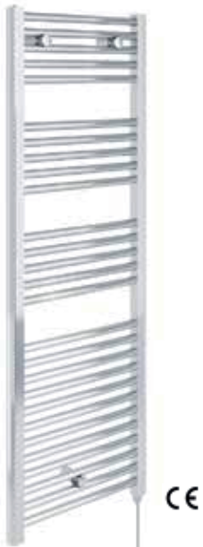
Model shown in the picture is 1375X480