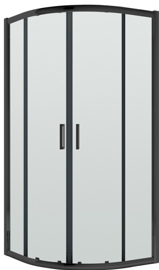
SQ Quadrant Enclosure

Description: 900X900x1850mm Quadrant Enclosure