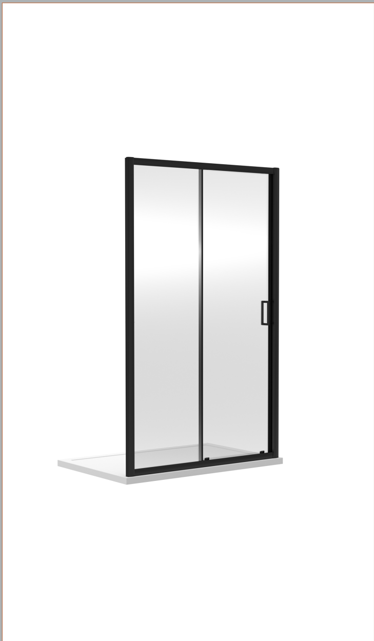
SQ Slider Enclosure

Description: 1000X1850mm Sliding Shower Door