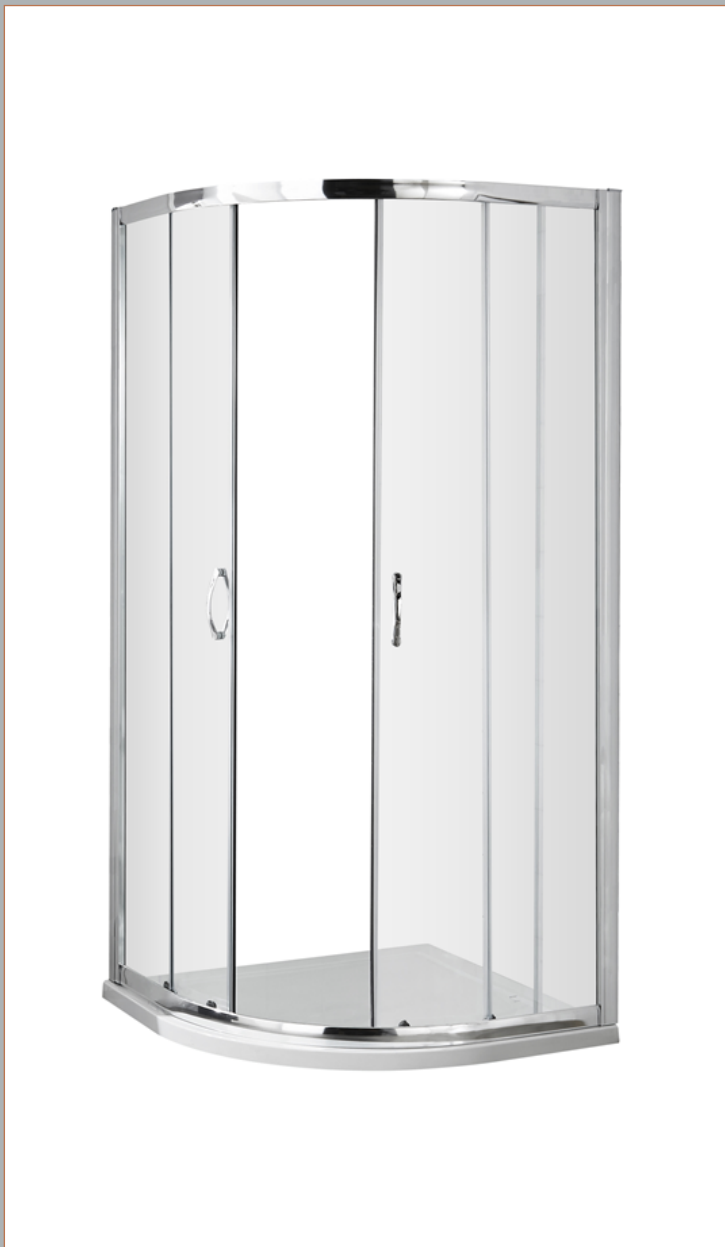
Ella Quadrant Enclosure

Description: Ella Quadrant Enclosure 800X800mm