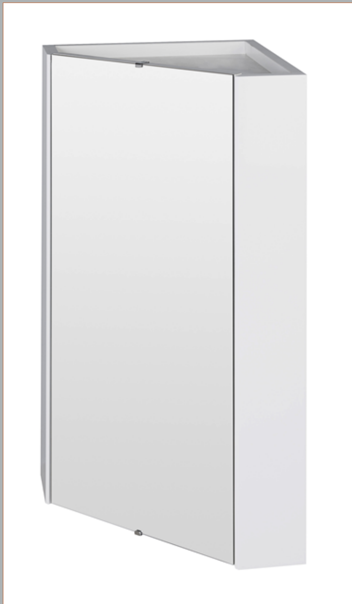
NVC118 - CORNER MIRROR CABINET

Description: Corner Mounted Mirror Cabinet